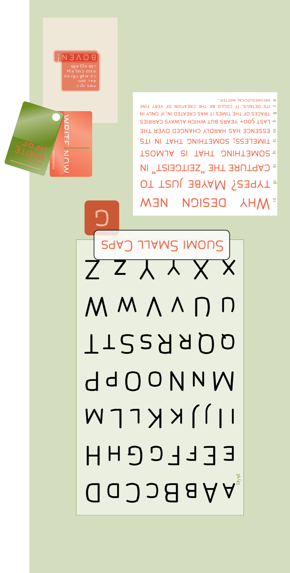
Just a typographic back-up mixed for quizzical viewing