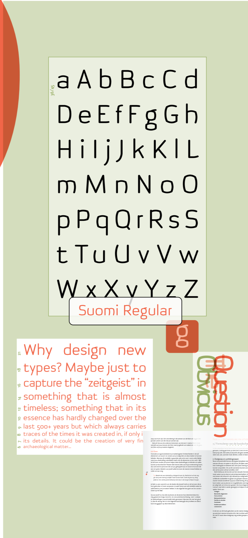
Just a typographic back-up mixed for quizzical viewing