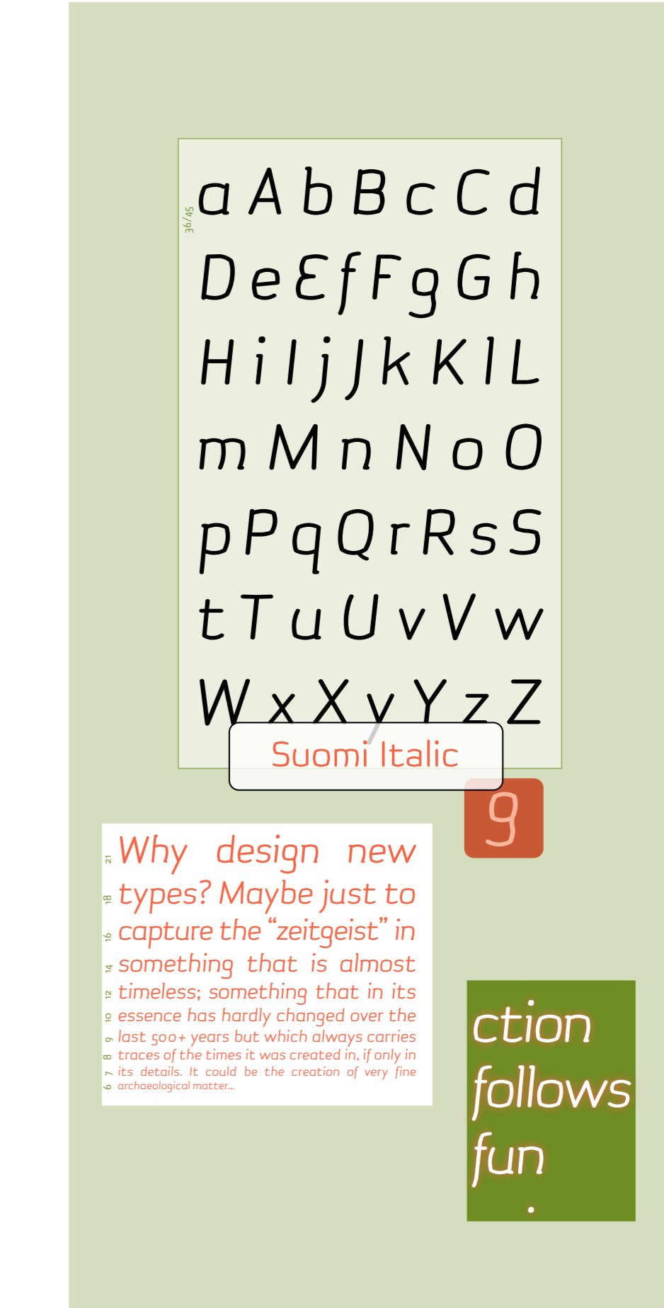
Just a typographic back-up mixed for quizzical viewing